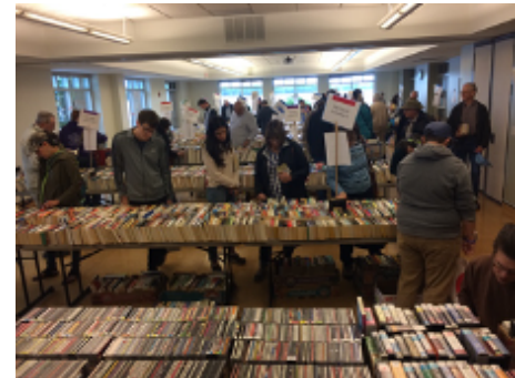
Friends book sale at current location in EGR Parks & Rec Department program rooms