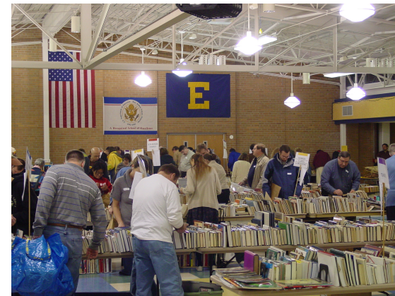
Friends book sale at EGR Middle School, January 2008

The East Grand Rapids Middle School Cafetorium was the next location for the Friends ’ book sales. This was a spacious venue which allowed for spreading out and really showcasing sale books! We worked in conjunction with the EGR School system.