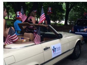
Fancy cars and Friends along the parade route