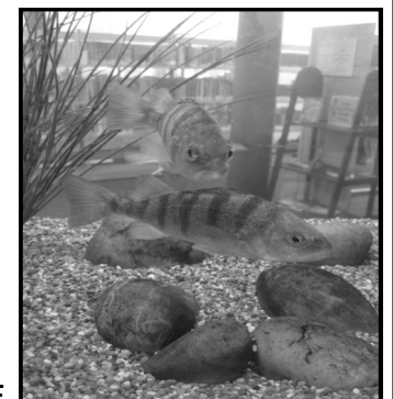
Fish and Turtle Aquariums

FRIENDS COME TOGETHER FOR THE GOOD OF THE LIBRARY & COMMUNITY.