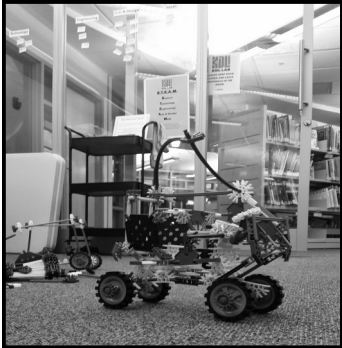
Glass KDL Lab Makerspace