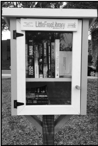
Little Free Library in the Park