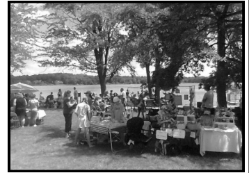
Children's Park Parties