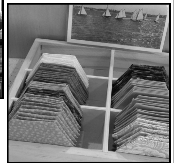
Hexie Quilt Community Project