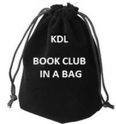
KDL Book Club in a Bag Titles